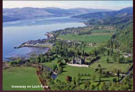
Inveraray on Loch Fyne