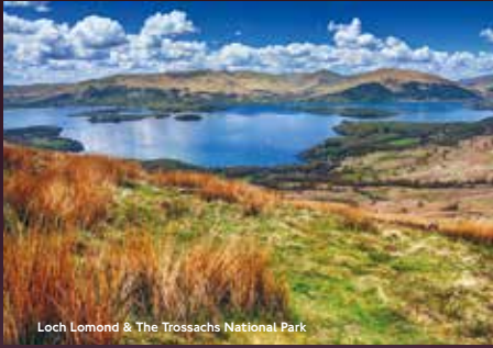
Loch Lomond & The Trossachs National Park