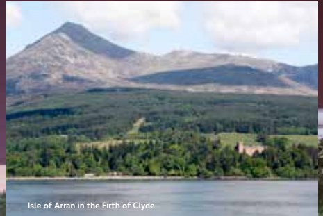
Isle of Arran in the Firth of Clyde