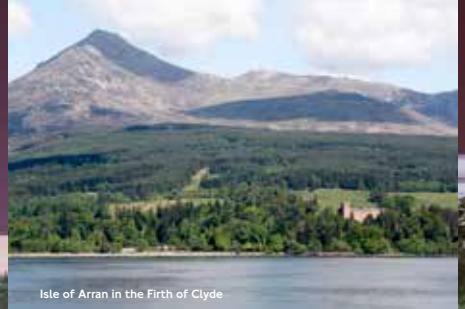
Isle of Arran in the Firth of Clyde