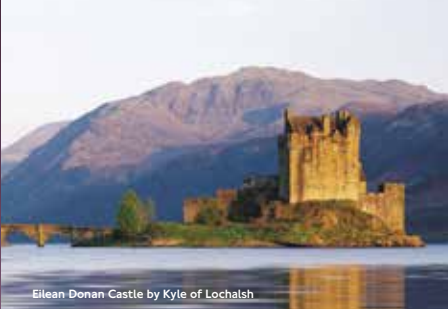
Eilean Donan Castle by Kyle of Lochalsh