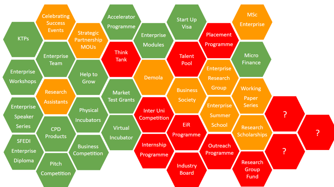
Figure 5: Visual Representation of UWS internal ecosystem

signifying unknown unknowns allowing for new ideas to be added following discussion around development of the current mapped ecosystem.